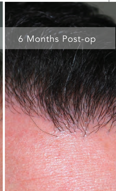
6 Months Post-op