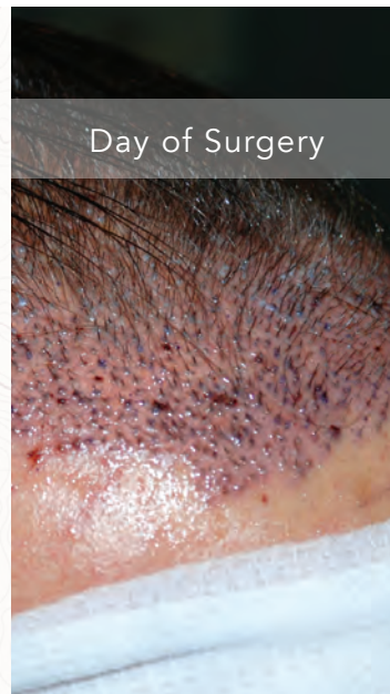
Day of Surgery