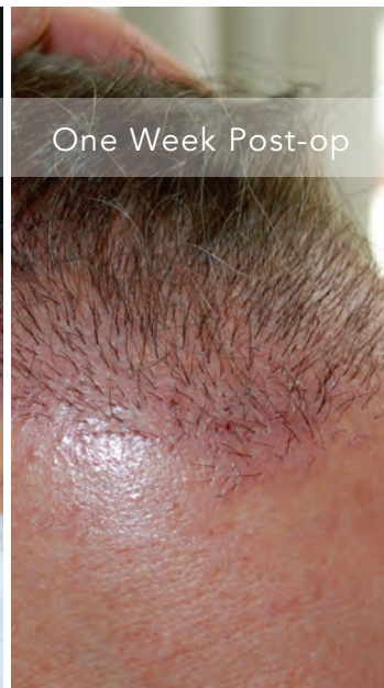
One Week Post-op